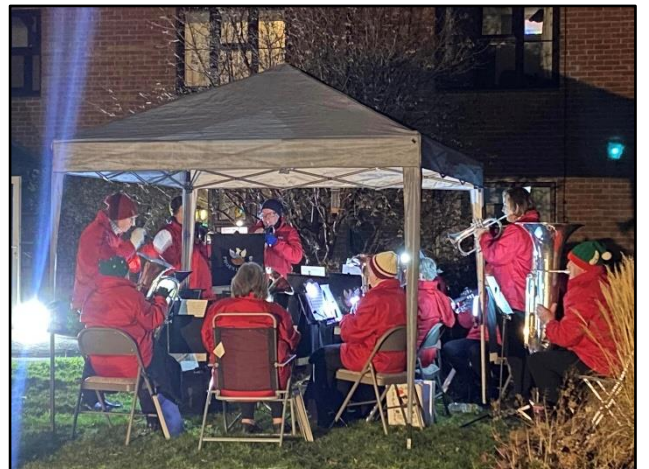
Friends of Brendoncare Nursing Home, Froxfield Carols Evening