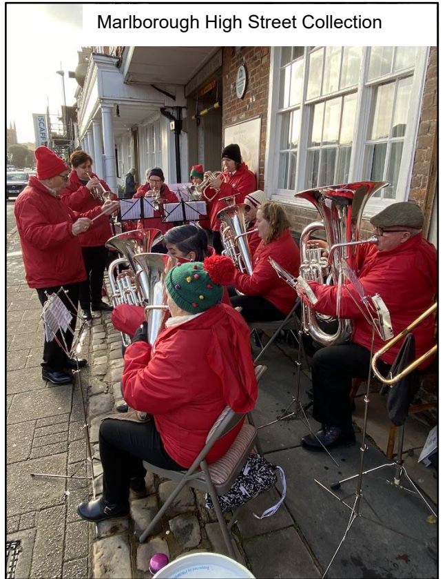
Marlborough High Street Collection