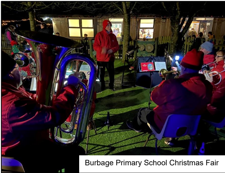
Burbage Primary School Christmas Fair