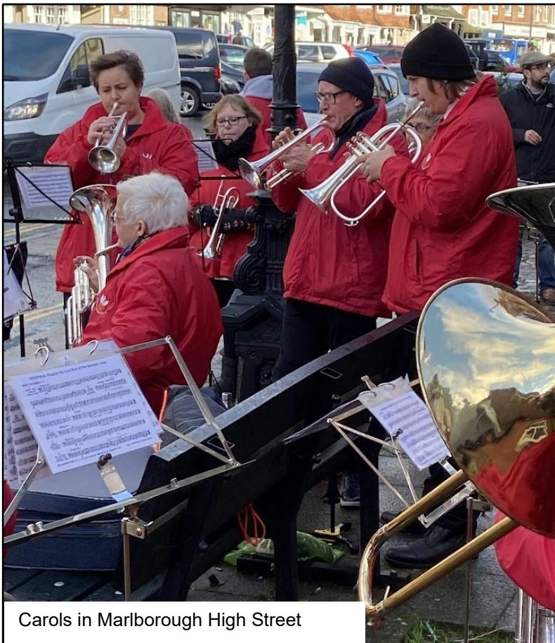
Carols in Marlborough High Street