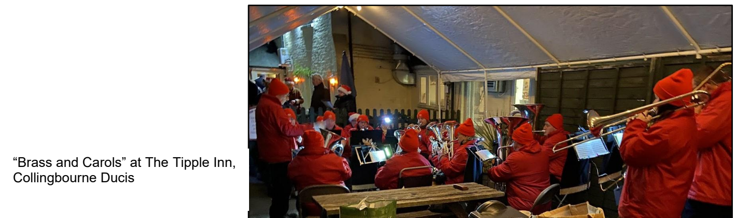
“Brass and Carols” at The Tipple Inn, Collingbourne Ducis