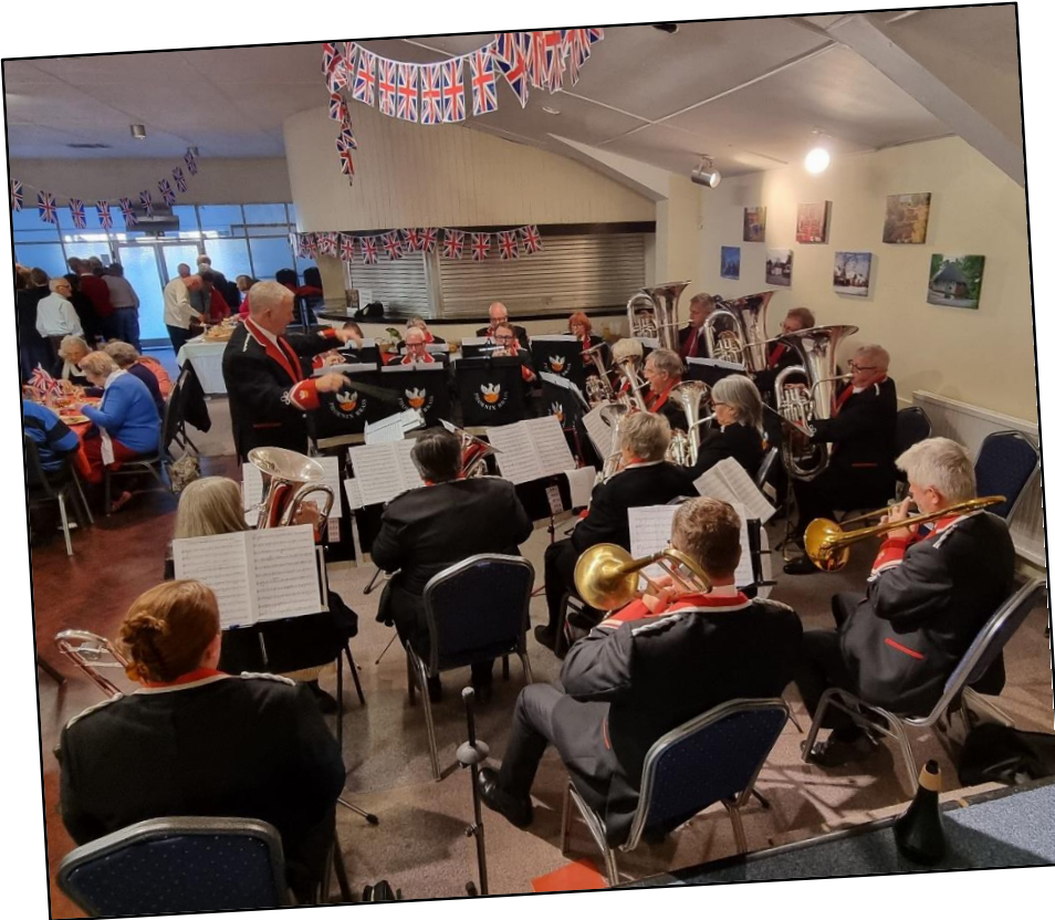
May 2023 Members of Burbage Good Companions and guests sat down to a dinner, with players from Phoenix Brass providing the musical backdrop during the evening.