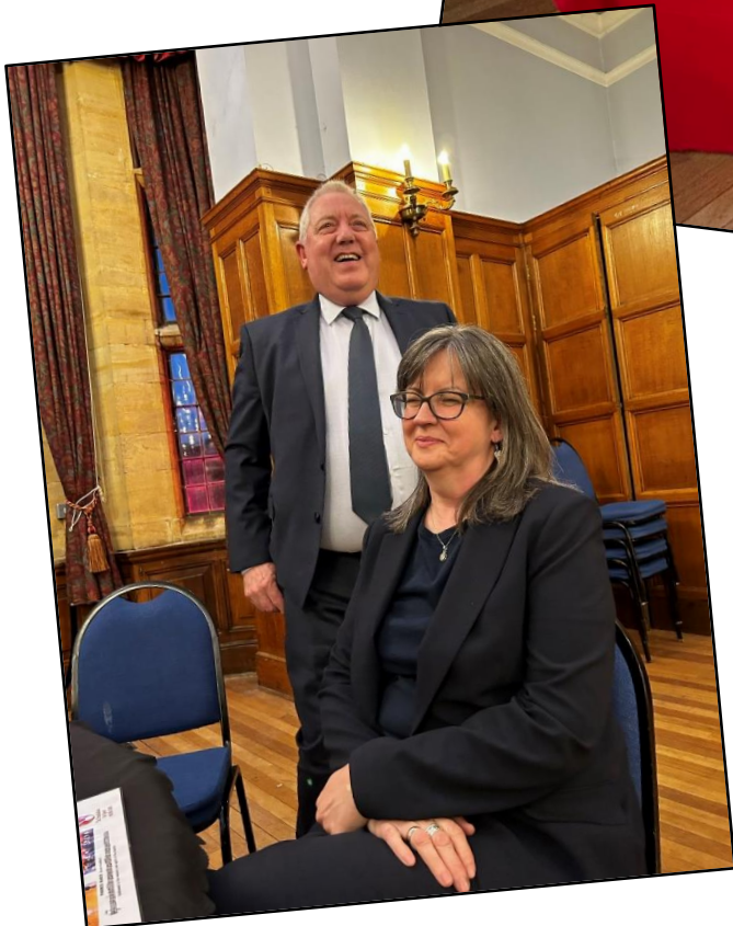
May 2023 Band Annual Dinner and Awards Evening at Marlborough Town Hall