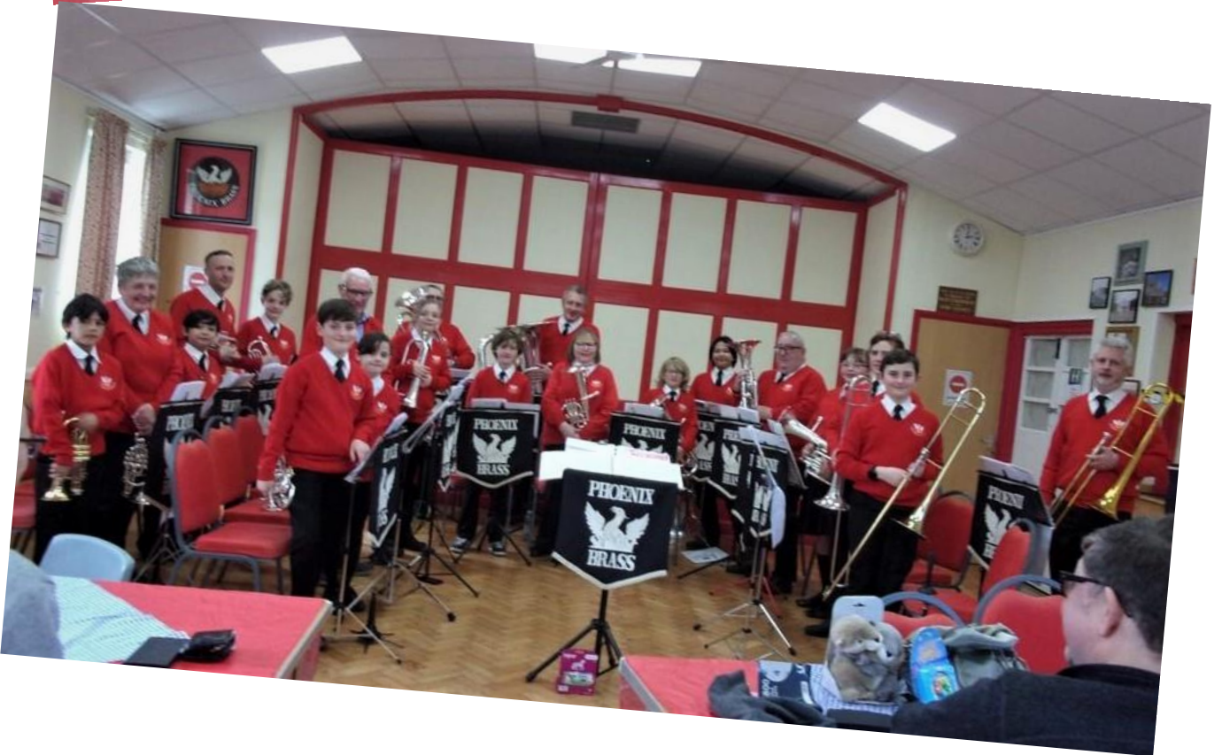
Training Section Coffee Morning – March 2023