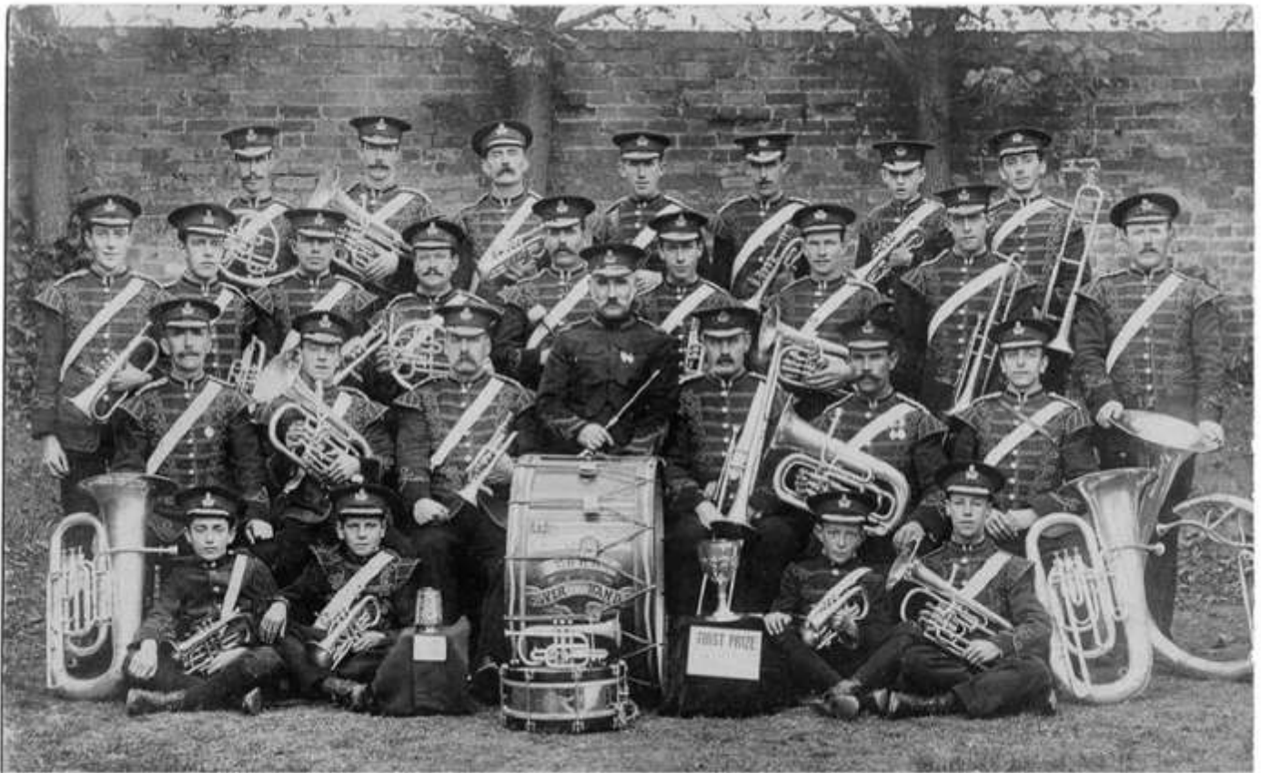
Photo above of Marlborough Silver Town Band in 1909. The band was active from the 1880s to the 1950s